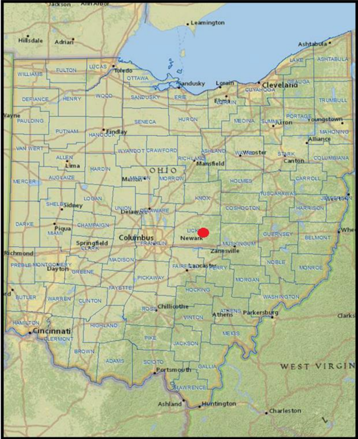
Figure 1 - General project area